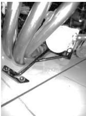
Front mounting bracket (A)