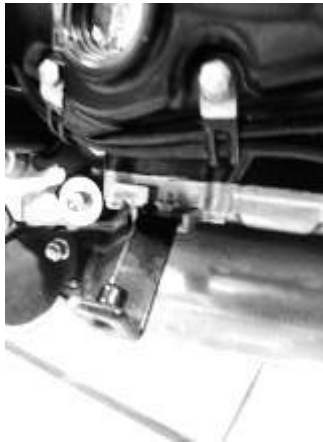
Left side bracket (B)